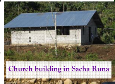
Church building in Sacha Runa

We are hoping to use the next few months for more language acquisition to better communicate with all of the people in the community.