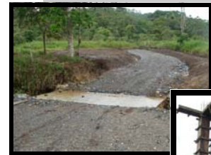
the new road, bridge and water tower