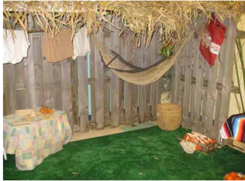
The “Ecuador room” from the Family Church’s GIC

We are set to return to Ecuador on March 30 from Miami. We are very excited to get back to the work of ministry, but are a little nervous after being away from it for so long. Our first order of business will be to reassess the current needs in Sacha Runa so that we can prioritize projects for the upcoming visiting groups (we already have three scheduled). In addition to construction type projects, we are planning on involving groups in other projects that we will be working on, such as teaching English or working on the Bible translation project.